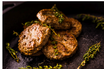
51363- 1.6oz Breakfast Sausage Patties Fully Cooked 100 Patties | $79.00