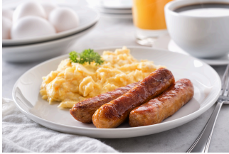
*58052-Breakfast Sausage 60pc/case | $30.00