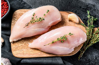
*60190-6oz Natural Chicken Breast 5.5lb case | $67.50