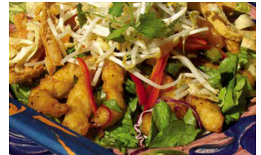
60166- Battered Ginger Chicken Fully cooked w/sauce 8.8lb case | $63.00