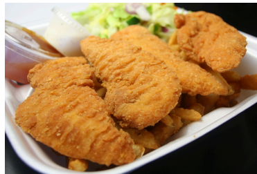
59392- Breaded Chicken Strips 5lb case | $27.50