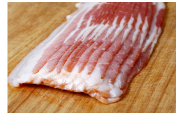
*55361-Natural Smoked Bacon 5 x 1lb Packages | $45.00