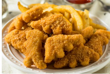
60854-Snakosaur Chicken Nuggets 8.8lb case | $63.00