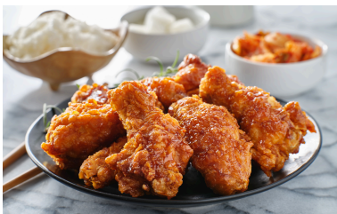
59438- Crispy Chicken Wings 8.8lb case | $89.00 (approx. 84 Wings)