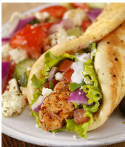
*50888-Pork Souvlaki 4oz 20 Skewers/case | $55.00