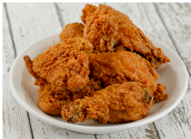
60257-KFC Style Breaded Chicken approx. 18pc/bag | $40.00