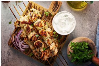
*61569-Chicken Souvlaki Skewers 20 Skewers/case | $67.00