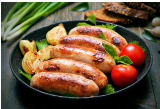
*58064-Sausage Combo Contains Beef, Chorizo, Mild Italian, Hot Italian & Banger Sausage 5lb case | $43.00