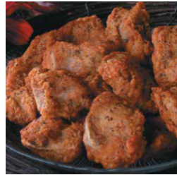
54447-Pork Dry Rib Bone In 10lb case | $80.00