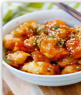
60656-Sweet Thai Chili Chicken 9lb case | $63.00