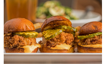
60169- Fully Cooked Breaded Chicken Chunks (various sized) 4.4lbs | $25.00