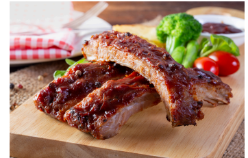
*54854-Pork Baby Back Ribs 11lb case | $72.00