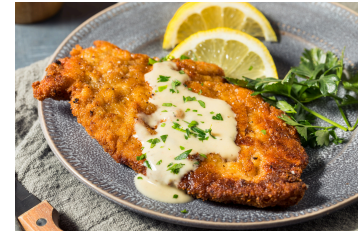
54636-4oz Breaded Pork Cutlets 40pc case | $69.00