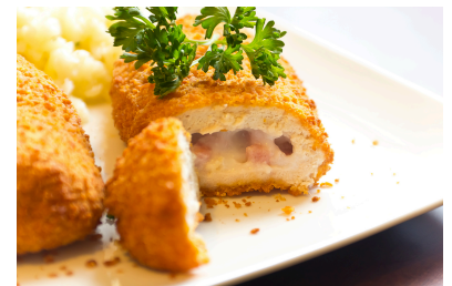
59411- 5oz Chicken Cordon Bleu 30 pieces | $84.00