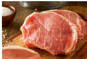
*55519-Boneless Pork Steaks 5lb/case | $30.00