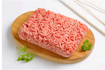
*55731-Ground Pork 5 x 1lb Packages | $29.00